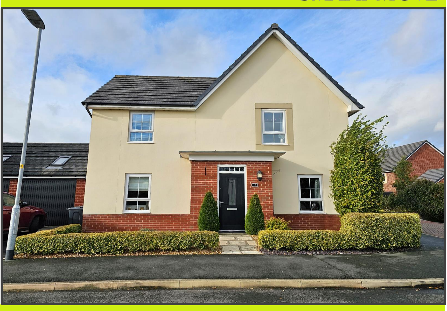
Asking Price £374,950